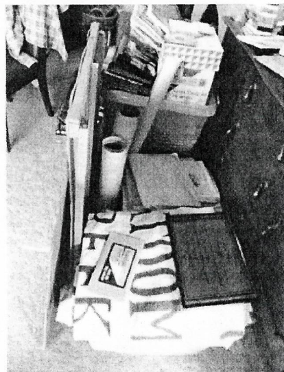
Figure 3 approximately 0.5 cubic metres of associated 3-D material and ephemera