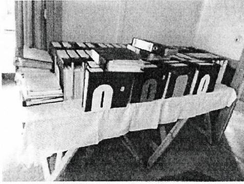
Figure 1 approximately 70 volumes of arch-lever folders of written documentation