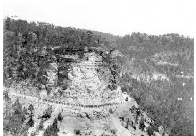
In the ANZAC spirit, 'Hitchens Own' (Coo-ees) ascend the Blue Mountains, marching up Berghofers Pass on 3 rd November 1915.

It would seem appropriate too, that leading up to the centenary of this historic march, the Blue Mountains community should recognise the Coo-ees as very much a local part of our ANZAC tradition.