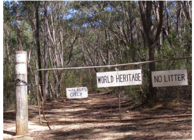
Gate at western end of Pulpit Road leading to Mt Elphinstone (alias Radiata) Plateau. Signage purportedly courtesy of a somewhat 'zealous' conservationist (more the merrier).

[ www.environment.nsw.gov.au - accessed 24-May-07]